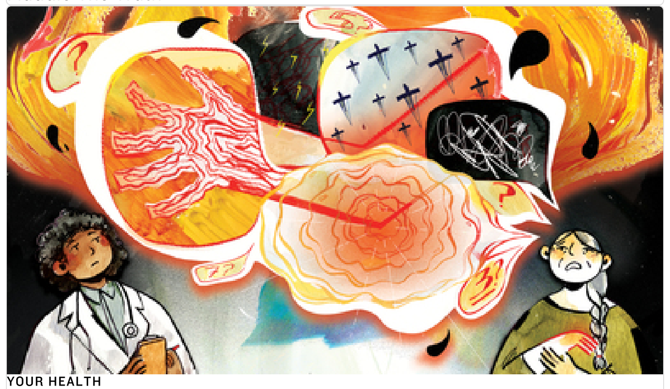
Words Matter When Talking About Pain With Your Doctor