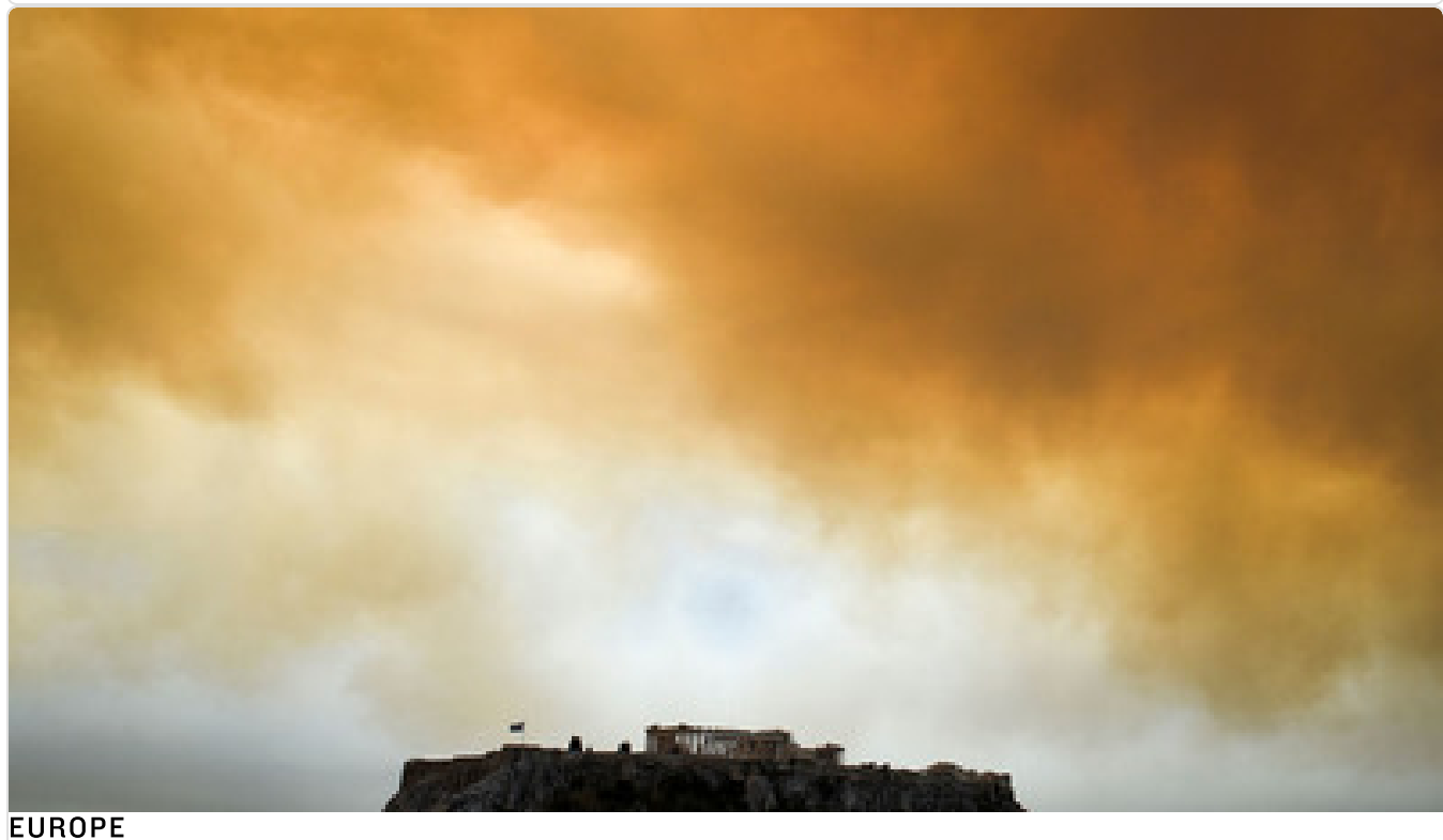
'A Terrible Day': Greek Wildfires Kill At Least 74 People, Devastate Resort Village